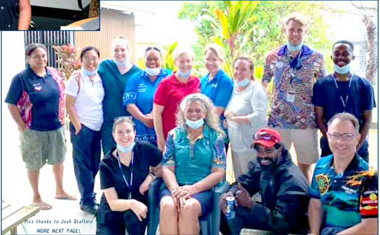
MORE NEXT PAGE!

UPDATE: Lockhart River residents turned out in force for the first week of COVID-19 Pfizer vaccinations, with more than half of the community receiving their first Pfizer dose! Our amazing team is pictured below, see you for the second round!