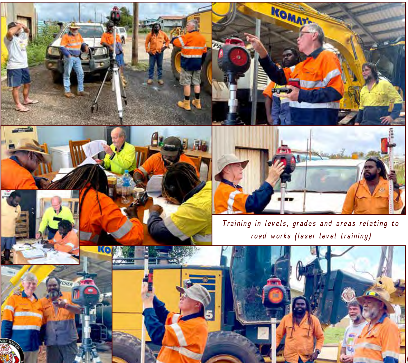
Training in levels, grades and areas relating to road works (laser level training)

redirection of traffic. “And finally, we have completed training this year with 10 new traffic controllers, five new excavator licences, six bobcat licences, four water truck licences and, for the first time in Lockhart River, two dogger crane licences. “So we’re fairly busy and with a full agenda for the rest of the year, we’re going to be flat out.”