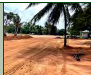
The new cultural precinct, under construction will be another way to draw tourists in.