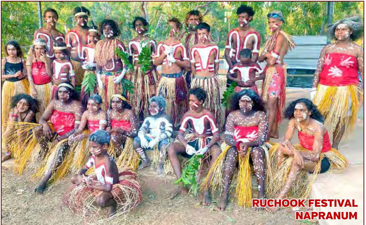
RUCHOOK FESTIVAL NAPRANUM