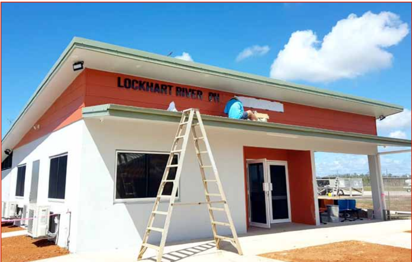
ABOVE: The new airport terminal's final stages of preparation.