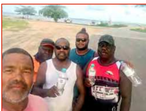
Men's Group walkers on Quintell Beach

"We want the community to see this is important material which is why it needs to have a plan around it - where or how do they want to see it in years to come?"