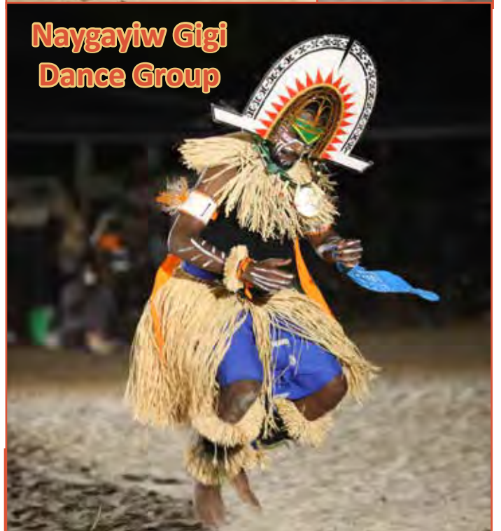
Naygayiw Gigi Dance Group