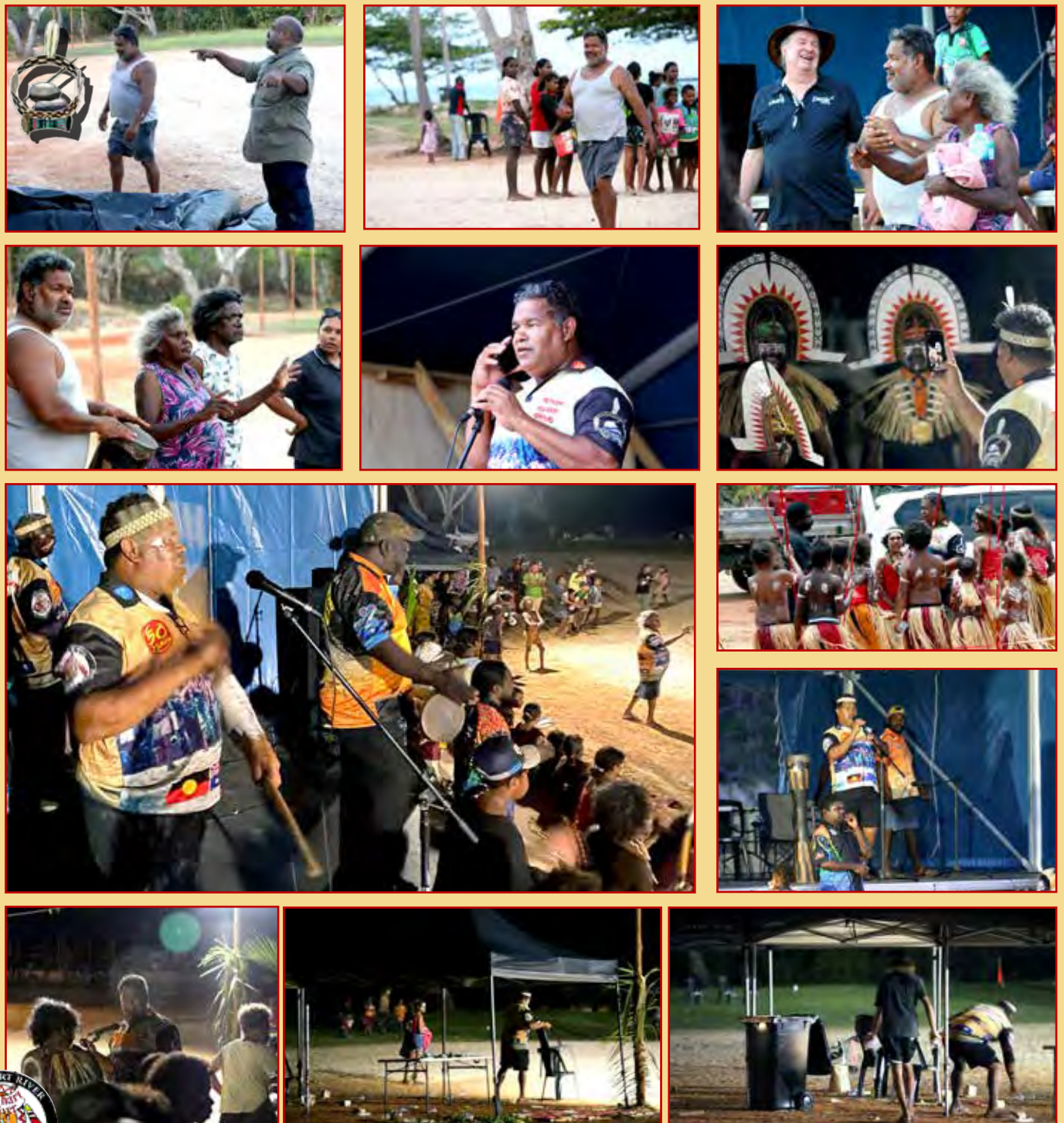
A leader by example: some of the many roles played by Mayor Wayne Butcher at the Paytham Malkari Festival last month... MORE PICS PAGES 19 TO 30