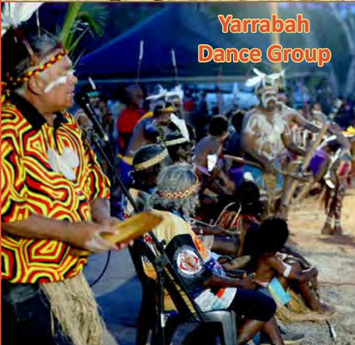
Yarrabah Dance Group