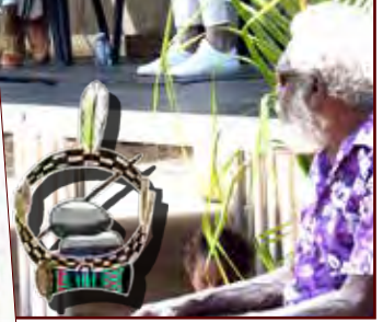
The Premier's three-hour visit was non-stop, covering all of the best of our community.