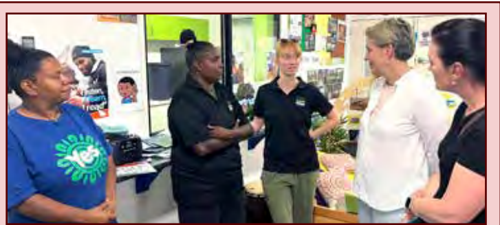
Thanks to Federal Minister for Environment and Water Tanya Plibersek and Queensland Minister for Environment, Science, Multicultural Affairs and the Great Barrier Reef Leanne Linard for their September visit to discuss the new World Heritage sites proposal.