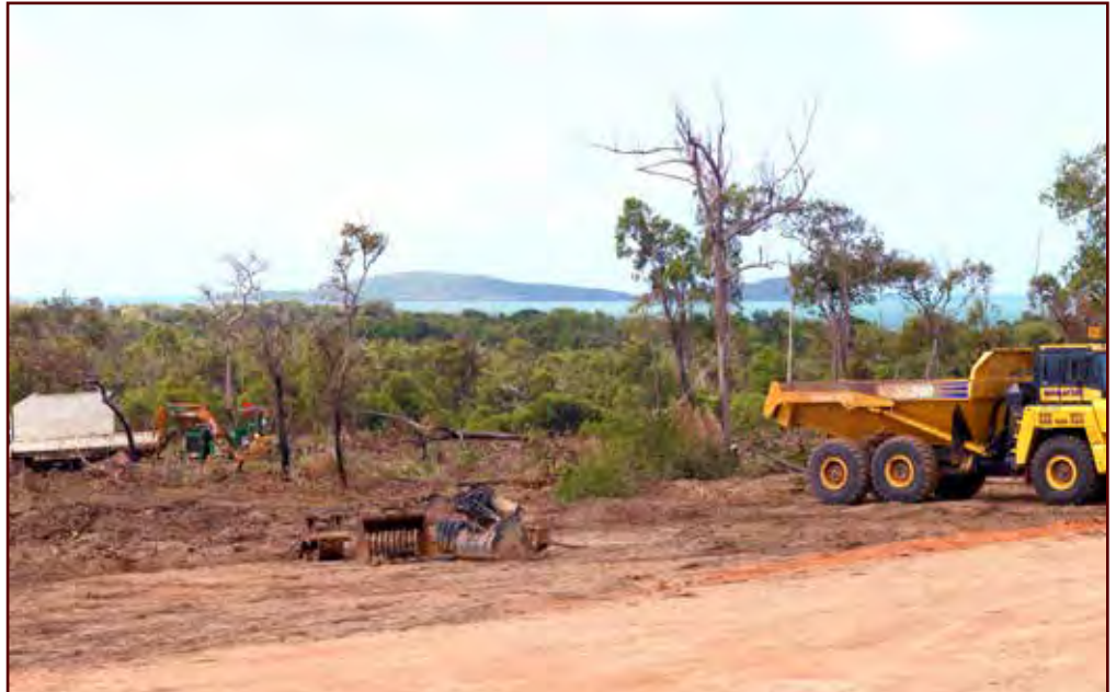
The new subdivision in July this year (above) and early November (below).

If there is anyone in the community who wants to be