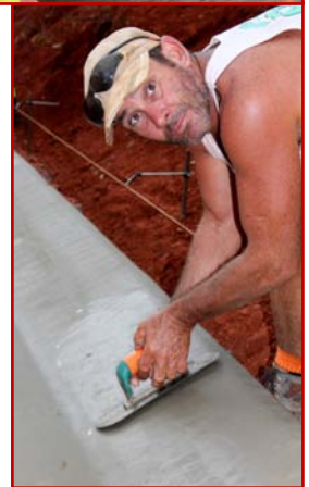
Top & Above: Road workers; Right: the fencing team